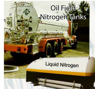
Oil Field Nitrogen Tanks