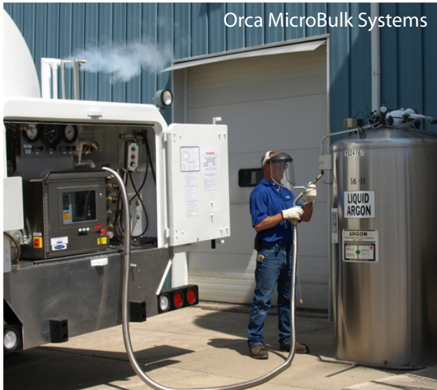
Orca MicroBulk Systems